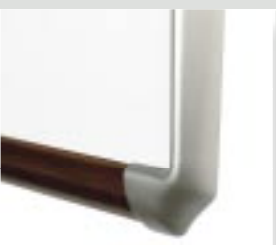
Cast aluminum and premium wood trim