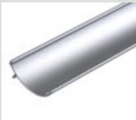
Sleek marker tray