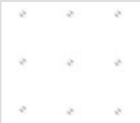
"Invisible Dot" system silkscreened on surface for straight writing